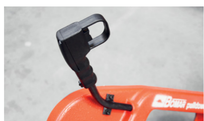
Ergonomic handle for starting the saw band and the arm's cutting.